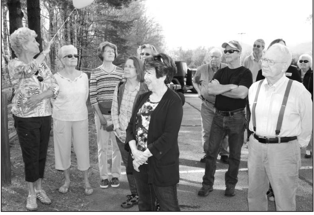
'A Blooming Affair' kicked off with the season opening on Saturday, April 15.

...that was extremely apparent at the dedication Saturday morning.